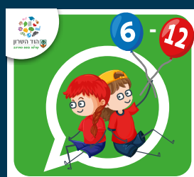
עדכוני ילדות וילדים (6-12)