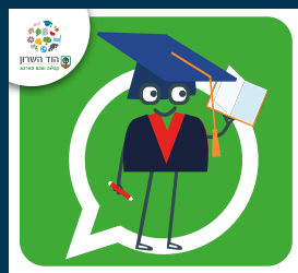
עדכוני מערכת החינוך