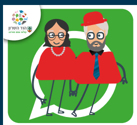
עדכוני ותיקות וותיקים +60