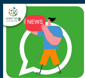
English Speakers Hod Hasharon