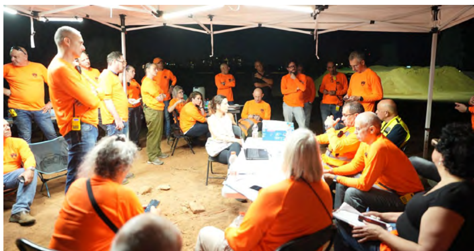
In the picture: The municipal rescue unit during a drill