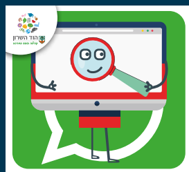
עדכוני דרושות.ים בעיריית הוד השרון