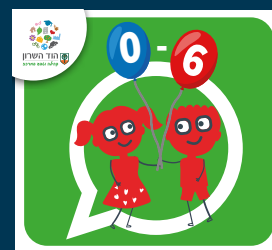
עדכוני הגיל הרך (0-6)