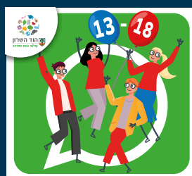
עדכוני נוער (13-18)