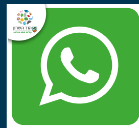
עדכונים ישירים מהעירייה בואטסאפ בכל התחומים