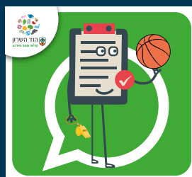
עדכוני בריאות, ספורט, קיימות ואיכות סביבה