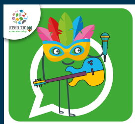
עדכוני תרבות ואירועים