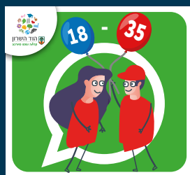
עדכוני צעירות וצעירים (18-35)